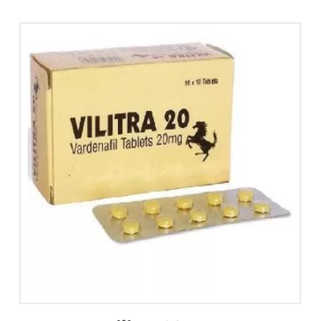
Vilitra 20 mg $22.00