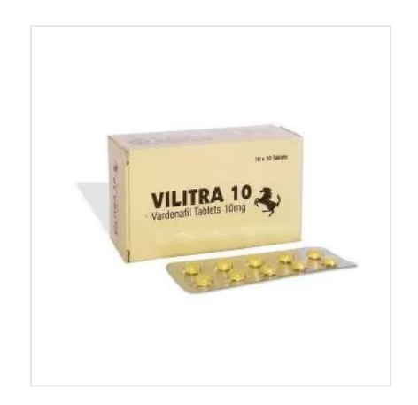
Vilitra 10 mg $15.00