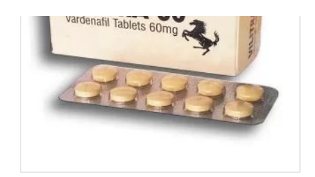
Vilitra 60 mg